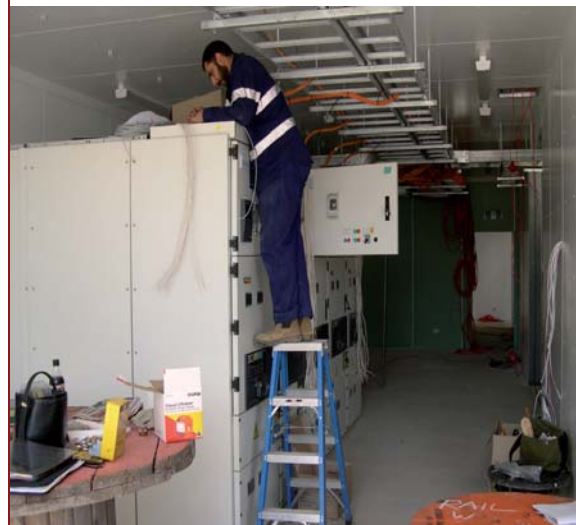
Capillary tubes branch off the main Xtralis VESDA sampling pipe and into the equipment cabinet, allowing the earliest possible warning of smoke within the cabinet.