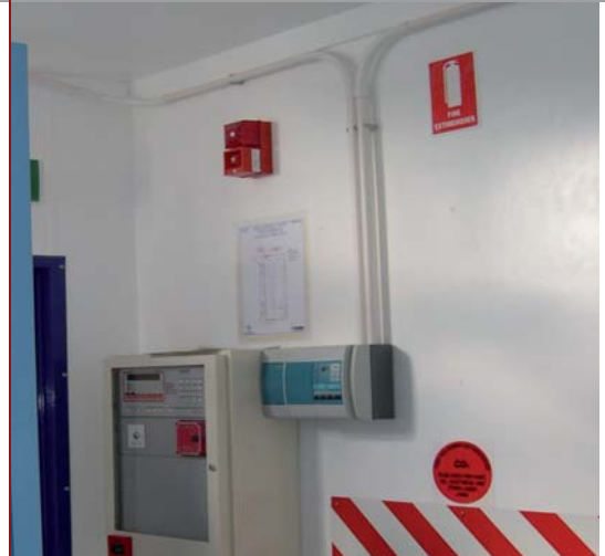
An Xtralis VESDA detector can be installed inside the portable substation or switchroom whilst it is being built or retrofitted onsite.